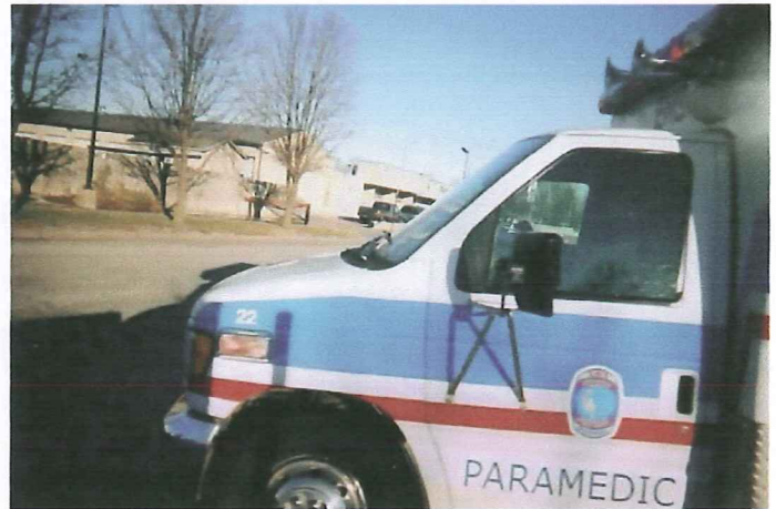
Ambulance departs WHCS for Wesley Medical Center at 9:14 AM, transporting a dying Christin Gilbert "code blue."