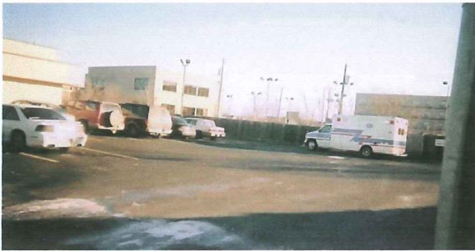
Ambulance arrives at 9:07 AM January 13, 2005.