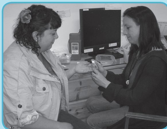
One of the services available at Outreach sites is HIV testing, as shown here.

Teen birthrates in Del Norte County have hovered above the state average for many years and continue to do so, though they have dropped from 65.6 per thousand girls ages 13-19 in 1996 to 45.1 per 1,000 in 2006. State and national teen birth rates have been declining since 2006. California's decline of 2.6 teen births per thousand is six times larger