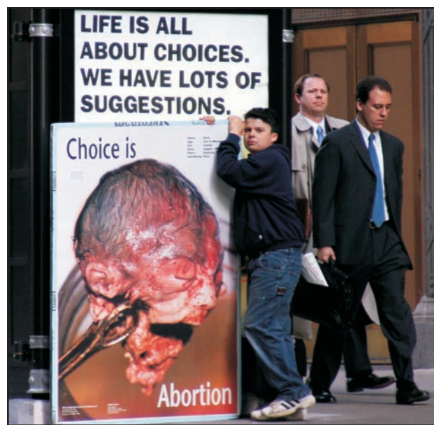
A bus shelter advertisement provided a uniquely appropriate location for a third trimester "Choice" sign during the April 12 Truth Day

On May 17, we brought the Tour to another favorite site, downtown Chicago's Daley Plaza. Hundreds of Chicagoans on their lunch hour saw the League's abortion signs and received literature on abortion. A man whose cousin had scheduled an abortion spoke to one of our twenty volunteers and was given resources and encouragement to help him talk her out of the abortion.