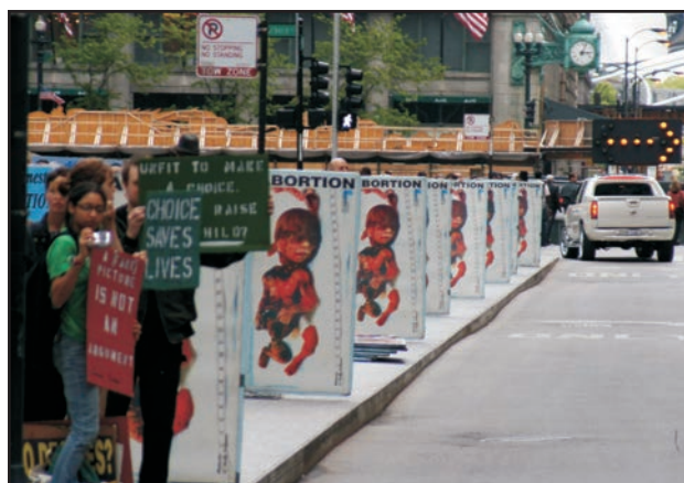
Truth Day at Daley Plaza, May 17, pro-abortion group at left

A pair of pro-abortion counter-protesters with NARAL signs stood off to the side for a short time during the beginning of the Tour site. No other counter-protesters were seen that day.