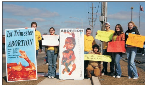
Some of the teens protesting Planned Parenthood Express, March 4