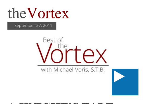
A KNIGHT'S TALE "A Knight's Tale" — and we mean it literally. June 28, 2016