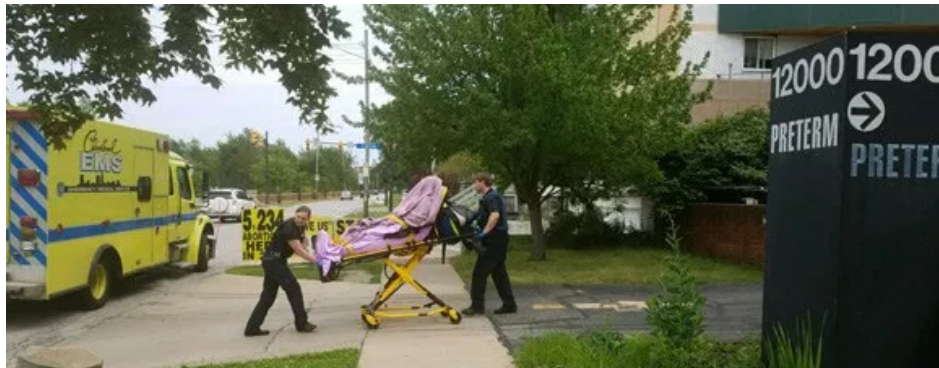
July 26, 2017: Another Preterm patient requires emergency hospitalization.