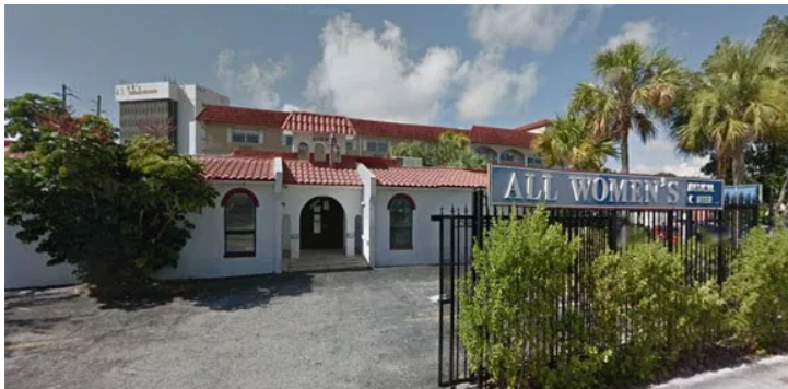
All Women's Clinic abortion facility in Fort Lauderdale, Florida.