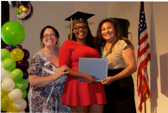
A proud graduate from our 2015 class.

We could not be more proud to announce the upcoming high school graduation this May 25 th of participants in our programs for pregnant and parenting teens and adults from Napa and Solano Counties. We will honor the scholastic achievements of graduates with a ceremony and reception at the John F. Kennedy Library in Vallejo.