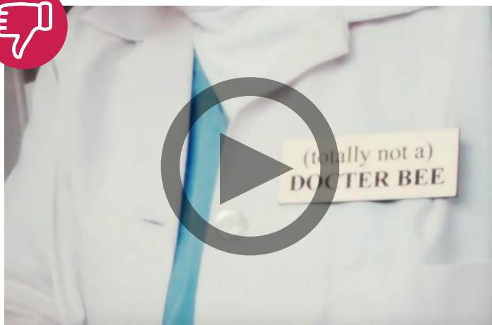
Enjoy this humorous take on anti-abortion centers by Full Frontal.