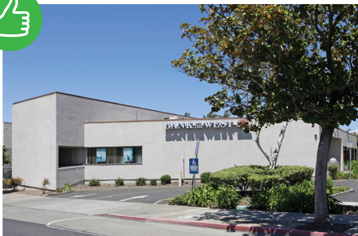
Our newest health center site prior to renovation.