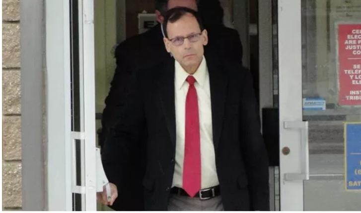
Disgraced Abortionist Steven Chase Brigham

September 11, 2018 By Operation Rescue 4 Comments