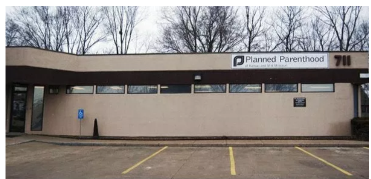
Planned Parenthood's clinic in Columbia, Missouri

September 11, 2018 By Operation Rescue 5 Comments