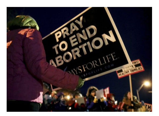
Missouri down to 1 abortion clinic amid legal battle