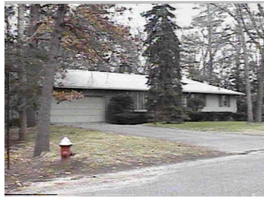
( http://images.vgsi.com/photos2/LongmeadowMAPhotos//00\00\20\04.jpg )