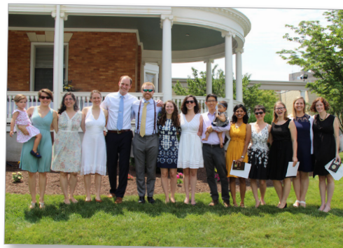
Memorial Hospital, family medicine graduates