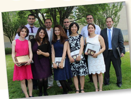
Memorial Hospital, internal medicine graduates