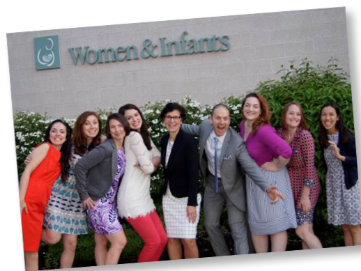
Women & Infants, ob/gyn graduates