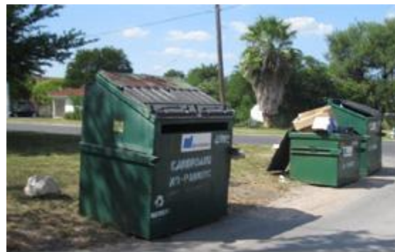
Dumpsters behind Whole Women's Health were open and spilling trash. Infectious waste and other hazardous materials, and private medical records were illegally dumped there.

Abortion promoters often make a public case that abortion records are particularly private. In Kansas, a three year politically motivated legal battle ensued over law enforcement subpoenas for abortion records for the purpose of investigating the sexual abuse of children. In the end, law enforcement had to drop its attempts to ensure the safety of underage girls who had abortions in Kansas because it was denied access to the children's names in the interest of protecting their privacy.