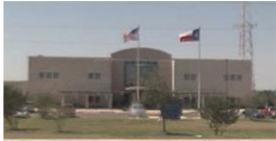
The Courthouse in McAllen, TX where judges dish out judicial bypasses, even apparently to underage girls coached by abortion clinics how to cover up for their sexual abusers.

In another call, an investigator posing as a 15-year old girl spoke with a clinic employee named Melissa at Whole Women's Health in San Antonio reveals the ease with which an underage girl can get a judicial bypass for just about any reason. Below is a partial transcript of relevant portions of the call.