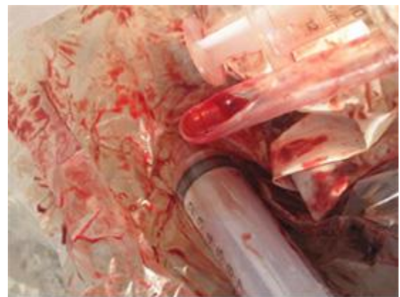
Bloody refuse, including cannulas used to suction apart pre-born babies and even human tissue was found illegally dumped.