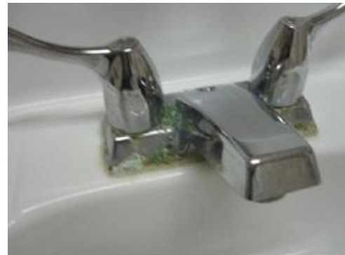
This corroded and leaky faucet is in the only bathroom at Whole Women's Health in McAllen, TX.

Poor lighting in the waiting and examination areas was the result of numerous burned out bulbs. A leaky roof had damaged the ceiling and created the possibility of an