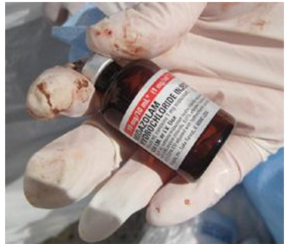
Drug vials were found in the open trash outside a McAllen, TX abortion mill. Some bottles still contained substantial amounts of the substances.

There was a concern that children or others could have discovered the partially filled drug vials and suffered serious injury if they had ingested any of it. Also discovered were empty prescription slips that could have been misused to illegally obtain prescription drugs. The dumping of these items shows a gross disregard for public health and safety.