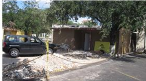
This is the rear entrance to Whole Women's Health, an abortion clinic in McAllen, TX. It is in a gross state of disrepair. Many of the violations discovered during a three month investigation were from this clinic.