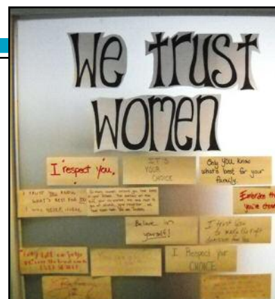
Message walls around the clinic let patients leave messages of support for each other.

true. I was scared for myself and my child. Living in fear of what could be or what kind of life my child was going to be subject to. I knew in my heart that this wasn't right. I made my decision to terminate my pregnancy and within a week I went in for surgery. I DO NOT and WILL NOT ever regret what I did. At that time it was what was right for my child and my life. You always must stand up for what you believe is right no matter what people think, this is your life, you are the one that lives it, nobody else."