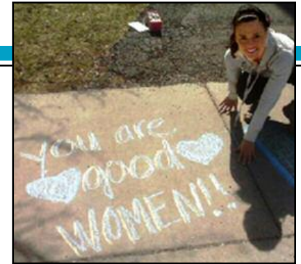
Preterm staff chalked the sidewalk with positive messages to counteract protesters.

■ "I am a struggling mother of two. I recently found that with this pregnancy the child has a very rare chromosomal disease. I would not be able to take care of a disabled child and provide my other