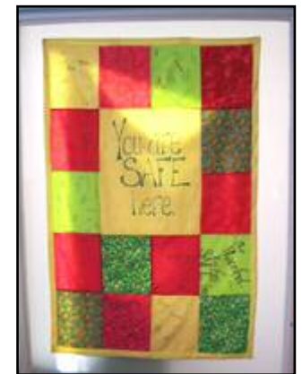
This quilt, made by board members, welcomes women to the second floor waiting room.

Millions of women's lives and futures will depend on it.