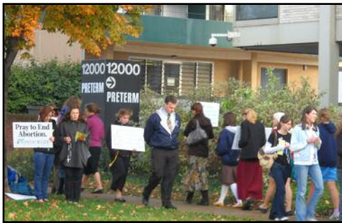
Protesters march in front of Preterm as part of a national "40 Days for Life" campaign.

Preterm was one of 30 clinics across the country that participated in a "Turnaway Study" to investigate the mental health, physical health, and socioeconomic outcomes of receiving an abortion compared to carrying an unwanted pregnancy to term. Conducted by ANSIRH (Advancing New Standards in Reproductive Health) at the University of California, San Francisco's Bixby Center for Reproductive Health, the study compares the experience of women who receive an abortion and women who are declined an abortion because they're too far along in their pregnancies. To date, most research has focused on whether elective abortion causes mental health problems and has been conducted by individuals with an agenda of making abortion illegal and inaccessible. The ANSIRH researchers are following participants over five years and will begin to release results in late 2011.