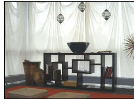
Patients and their families can visit Preterm's Reflection Room for spiritual comfort.

Preterm's Reflection Room continued to serve as a place for meditation and spiritual comfort. This multi-faith sanctuary, which we created in 2008, offers patients and their significant others prayers, affirmations, and other resources to help them find peace and clarity