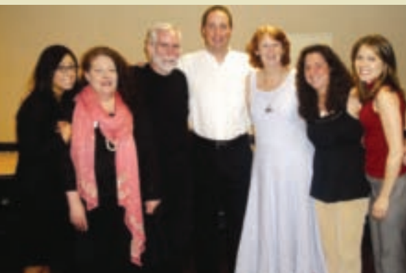
Event coordinators and providers at Caregiver Wellness Day.

NYM partnered with Leeza’s Place to host a Caregiver Wellness Day at the Park Slope Geriatric Day Center. The event provided support and rejuvenation for caregivers who spend much of their time caring for sick or disabled loved ones. The event included workshops in stress reduction and meditation, the Feldenkrais Method, Qigong and nutrition.