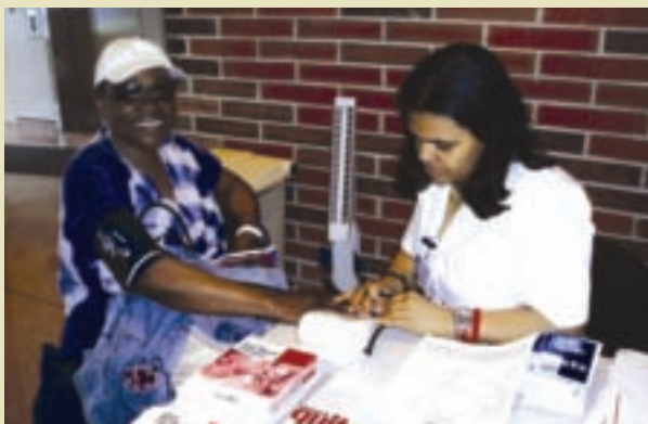
Learning how to detect signs of stroke at Stroke Alert Day.

New York Methodist also offers a variety of support groups, classes and resources, which are available free of charge to members of the community.