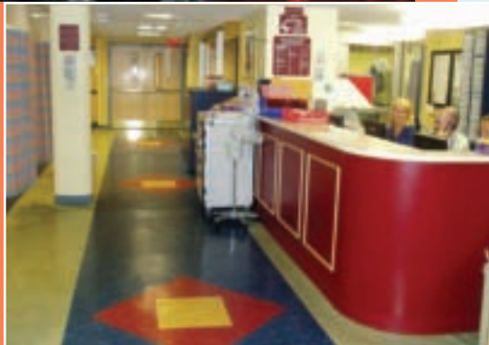
top: The new Patient Care Pavilion from Seventh Street. bottom: The new pediatric emergency room.