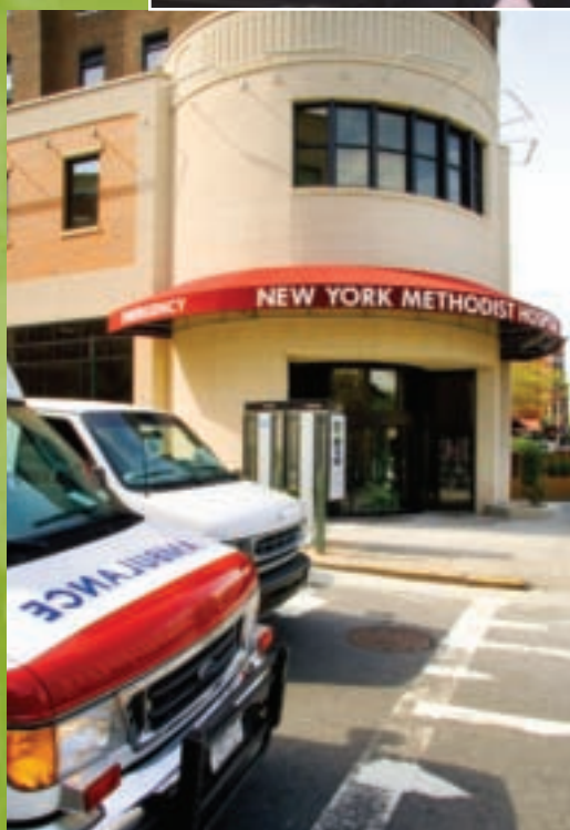
The new Seventh Avenue entrance to NYM's Emergency Department.