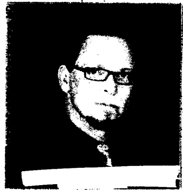
Photo must have been taken within the last 60 days and be at least 2" x 2" in size. Sign the photo in ink across the lower portion of its front side.

RECEIVED NOV 13 2002 NEVADA STATE BOARD OF MEDICAL EXAMINERS