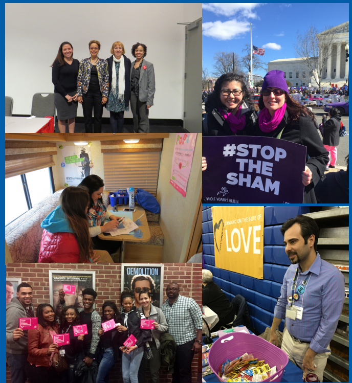
Images, clockwise: Celebrating the 43rd Anniversary of Roe v. Wade with a screening of Grandma and discussion on Feb. 11 at Stony Brook University. Rallying at the US Supreme Court on Mar.2. Tabling and presenting at PrideWorks on Mar. 23. Screening Trapped in Huntington on Mar.24. Administering an HIV tests on SmartWheels during Get Yourself Tested Month at Westchester Community College.

Donate today! Visit www.pphp.org/donate or call (914) 467-7337.