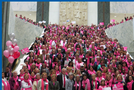
Day of Action, Albany, NY

We will be going back to Albany in January 2017 and hope you will join us.