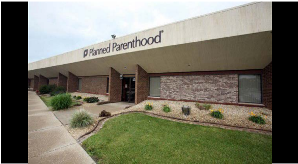
The Planned Parenthood clinic in Merrillville provides reproductive and other health services for women and men.