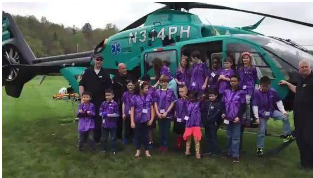
A Jets player and a helicopter are highlights of the Morristown event.

Published 5:00 a.m. ET Oct. 5, 2017