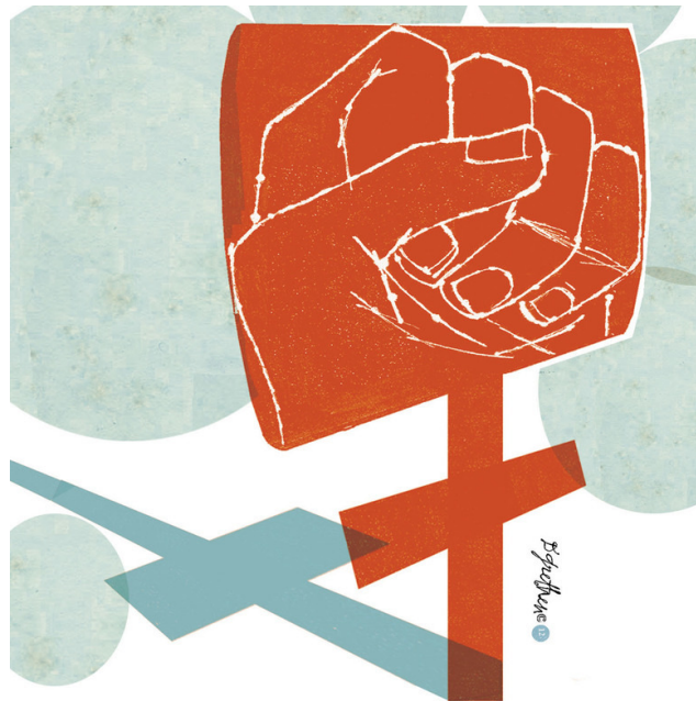
Donna Grethen / Op Art (Donna Grethen)

Originally published July 28, 2015 at 4:53 pm Updated July 29, 2015 at 10:15 am