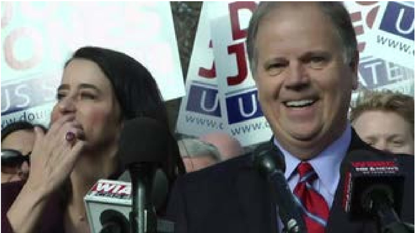
VIDEO: Democrat Wins Alabama Senate Seat In A Stunning Upset