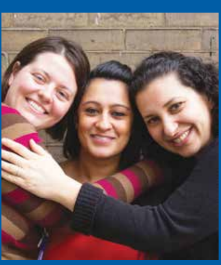
Above image: Three of the Fellows who are being trained in PPHP's New Rochelle health center.

By training more physicians, PPHP is educating them to provide better