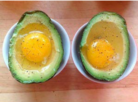
Shocking Link Between Eggs and Diabetes