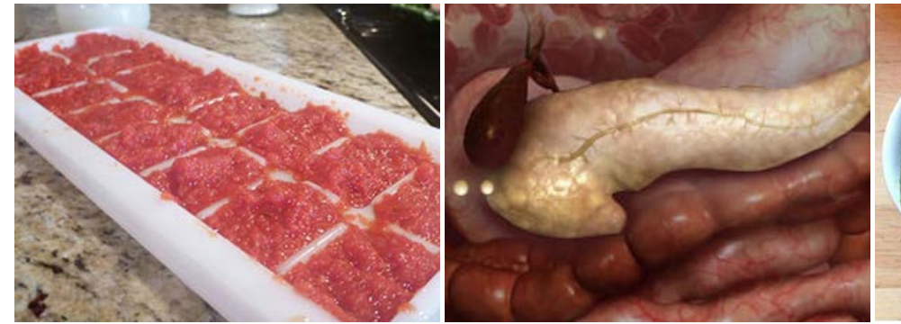
Constant Fatigue Is A Warning Bad News About Metformin Sign - Here's The Simple Fix