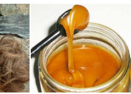
This Alzheimer's-blocking snack may be the "memory saving discovery" of the century. See why here Nutrition and Healing