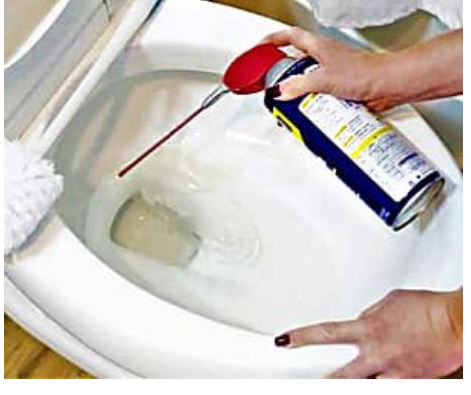
The One WD40 Trick Everyone Should Know About