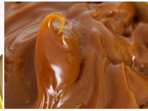
This Alzheimer's-blocking snack may be the "memory saving discovery" of the century. See why here Nutrition and Healing