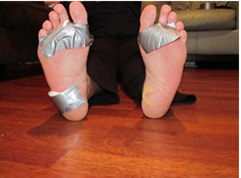
Doctor's New Discover Makes Foot Calluses "Vanish"