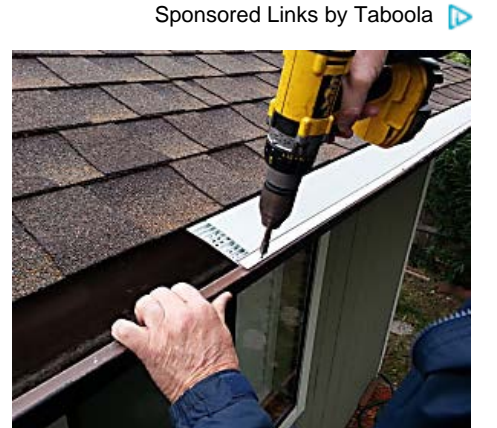
The Revolutionary 50 Micron Filter allows you to avoid cleaning gutters for life