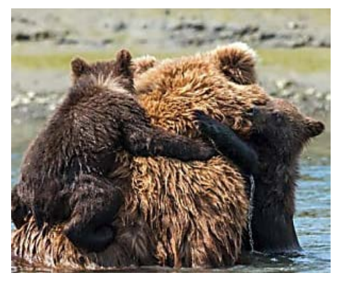
Mama Bear Pleads To Man To Save Her Drowning Cubs