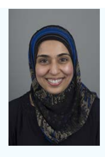
Instructor in Obstetrics, Gynecology and Reproductive Biology