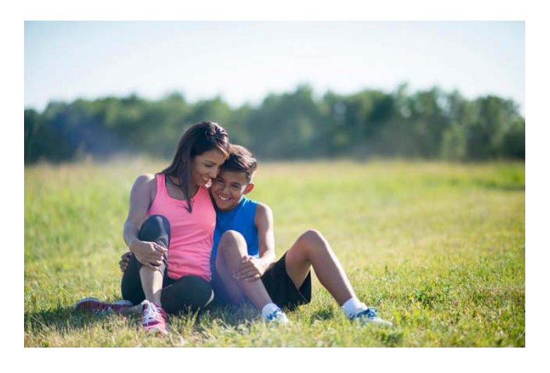
A Patient's Guide to Breast Cancer