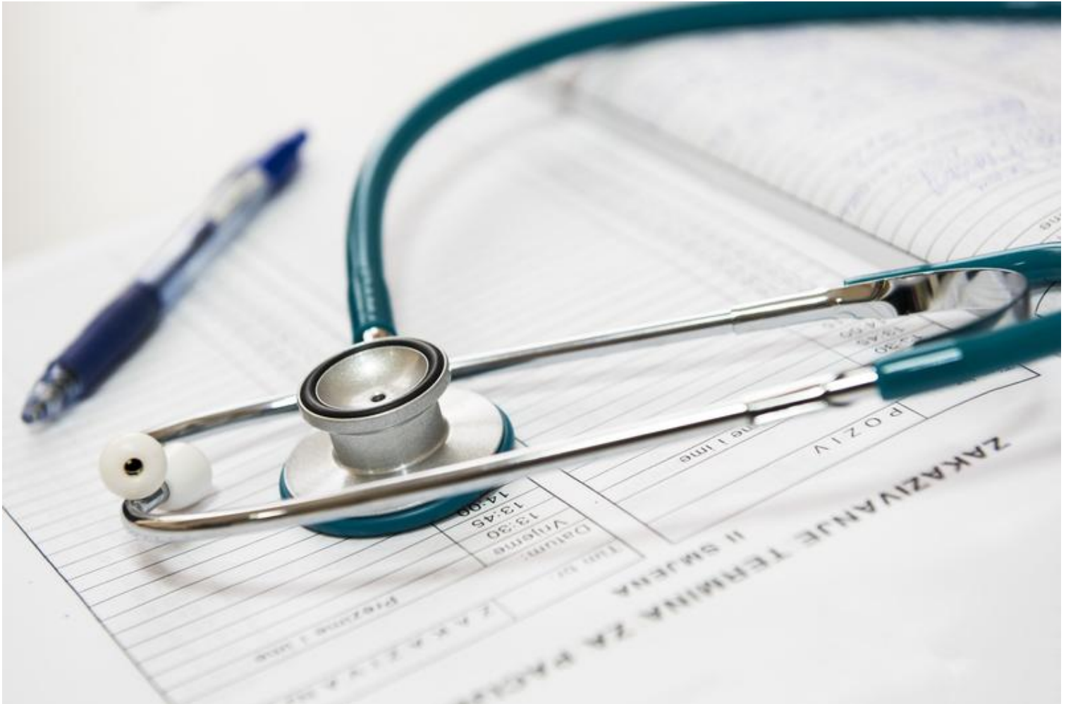
( http://mediad.publicbroadcasting.net/p/wosu2/files/styles/x_large/public/201807/medical-appointment-doctor-healthcare-40568.jpeg )

subject=New%20Abortion%20Clinic%20Opens%20On%20Columbus%27%20North%20Side&body=http%3A%2F%2Fwww.tinyurl.com