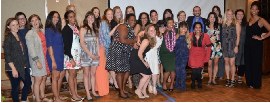
Oakland OB/GYN Resident Roster 2016/2017