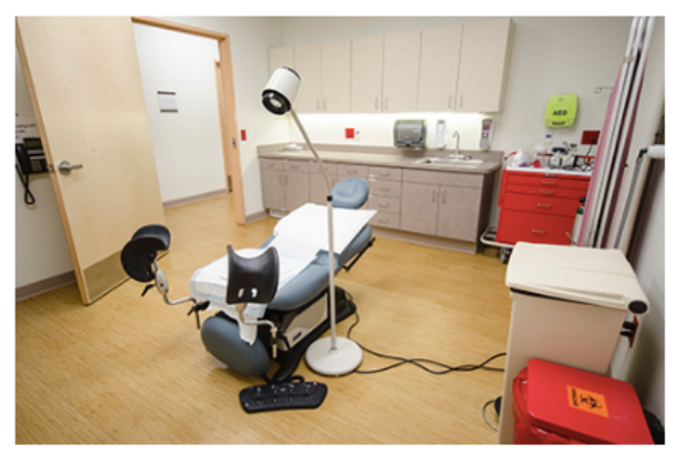
The UNM Center for Reproductive Health is a full-service family planning clinic (3 miles from the hospital) providing:

In addition, Southwestern Women's Options is currently listed as a UNM Clinical Training Site.