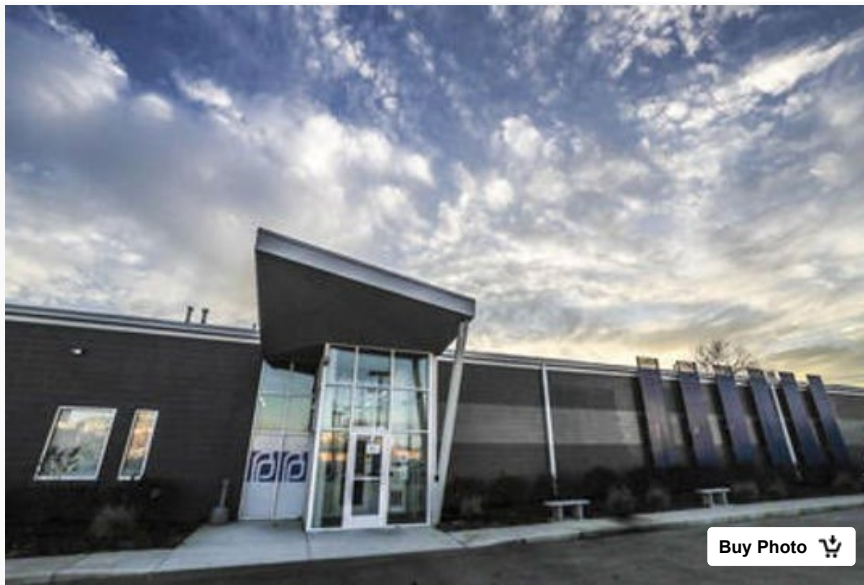
Planned Parenthood office in Louisville