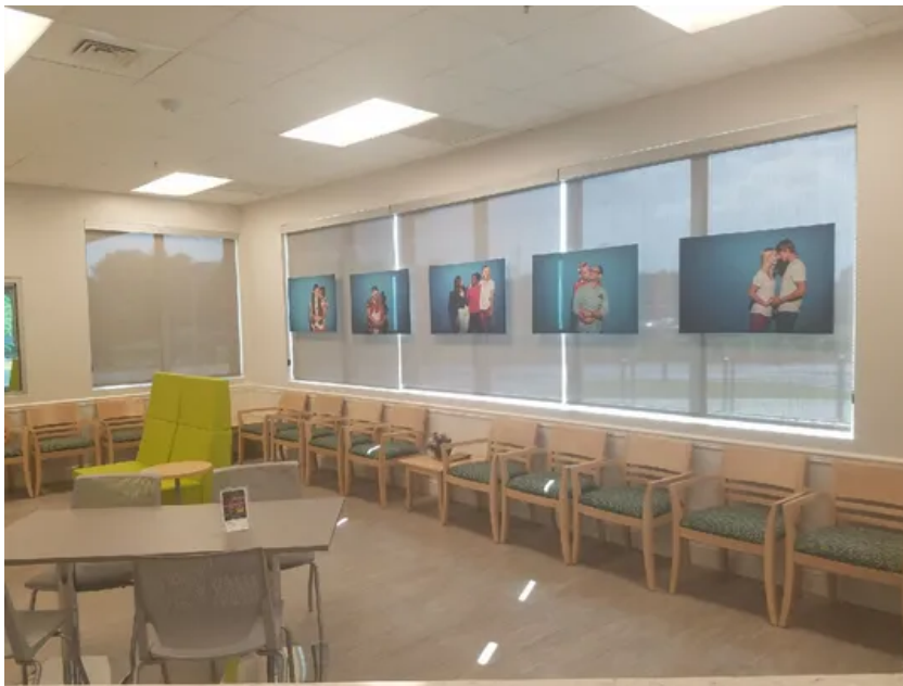
Planned Parenthood opens its new Tallahassee center with a grand opening Monday.

The Planned Parenthood Tallahassee health center will provide the full range of sexual and reproductive health services. These services include lifesaving cancer screenings, birth control, breast exams, testing and treatment for sexually transmitted infections, pregnancy testing and options education, and abortion services. The new Planned Parenthood center anticipates serving more than 5,000 patients annually once the health center is fully operational.