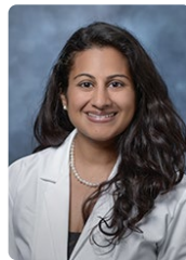
Director, Ryan Program