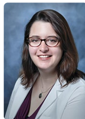
Director, Obstetrics and Gynecology Residency Program