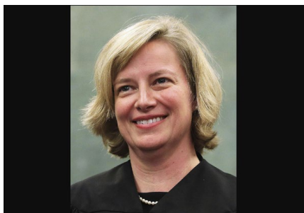
Hearing set before Arkansas abortion bars start