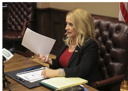
Rutledge asks for more time to respond to abortion case