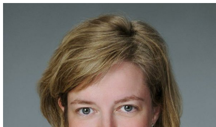
Judge sets July 22 hearing on Arkansas abortion restrictions