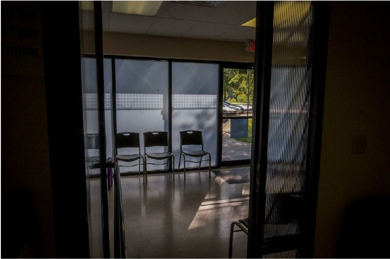
The Planned Parenthood Great Plains clinic in Fayetteville is shown in August.

Planned Parenthood has stopped providing abortions at its Fayetteville clinic while it searches for a new home in northwest Arkansas, its chief executive officer said in court documents filed Friday evening.