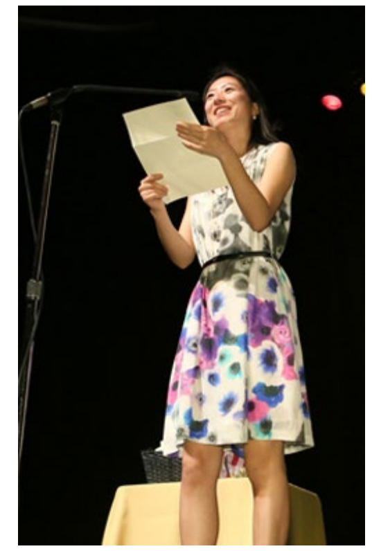
"It was a weird mix of anxiety and excitement all the while thinking your name would be the next one called. It was great watching everyone, but it just built up my own butterflies."