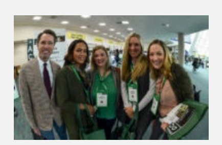
Welcome to the 2018 Annual Meeting