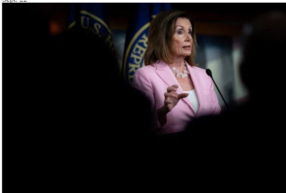
As Trump Confirms He Discussed Biden With Ukraine, Pressure to Impeach Builds Sept. 22