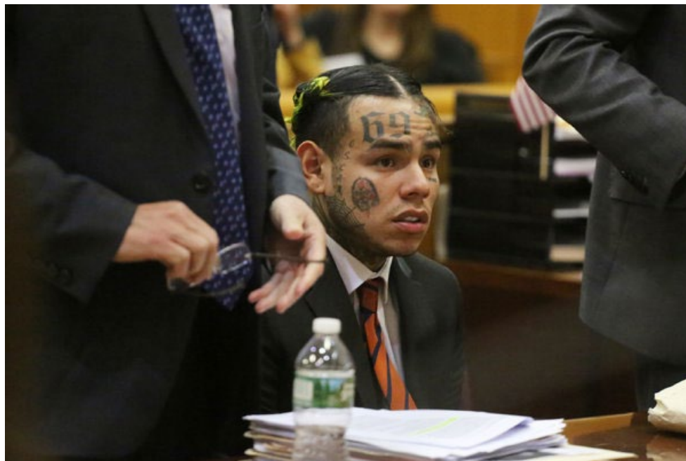
Tekashi 69: Can He Disappear After Testifying Against the Bloods? Sept. 22