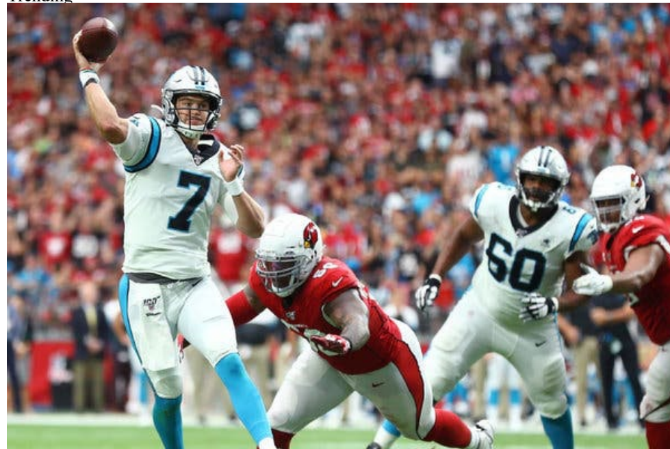
What We Learned in N.F.L. Week 3 5h ago