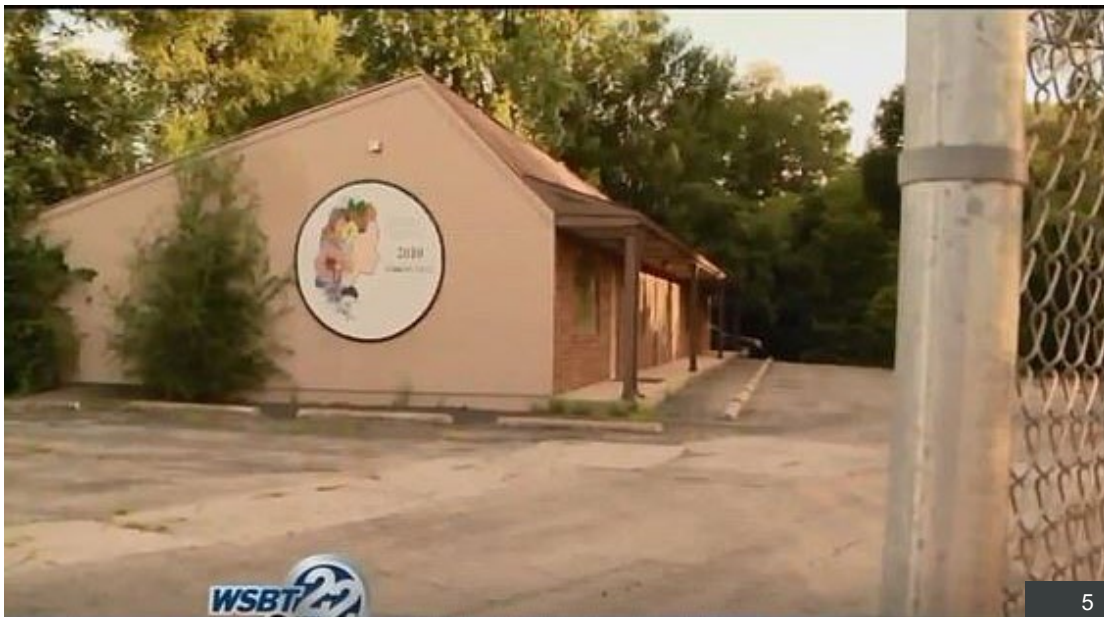
He had been carrying out the procedures in South Bend, Indiana, at the Women's Pavilion

His family contacted the Coroner's office on Thursday about possible foetal remains being found at the home, after they were going through the property.