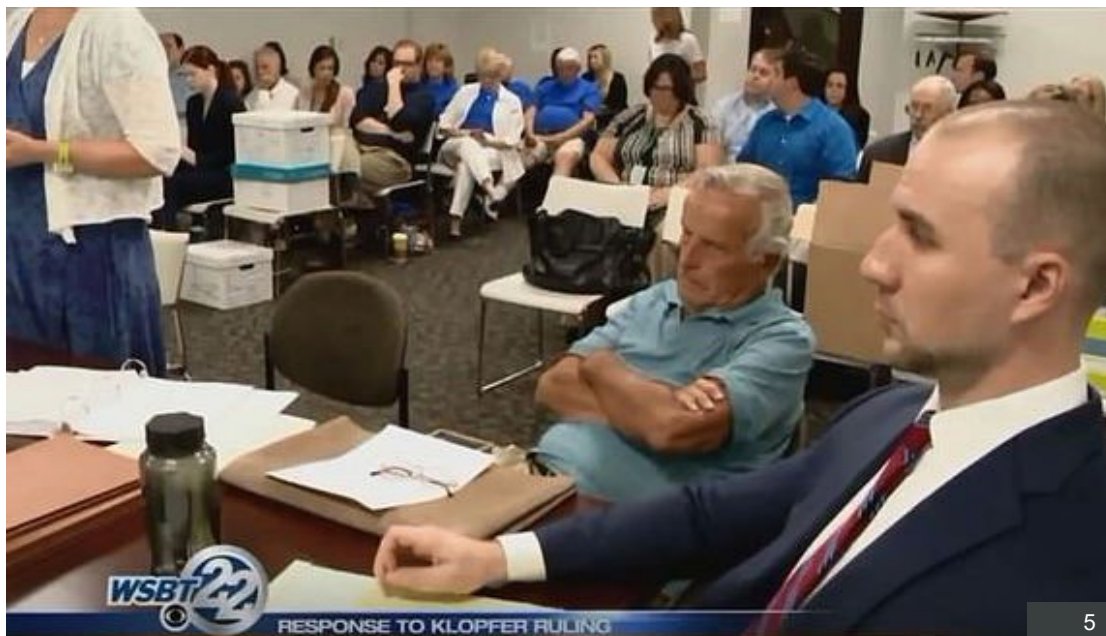
Dr Klopfer's licence was suspended in 2015