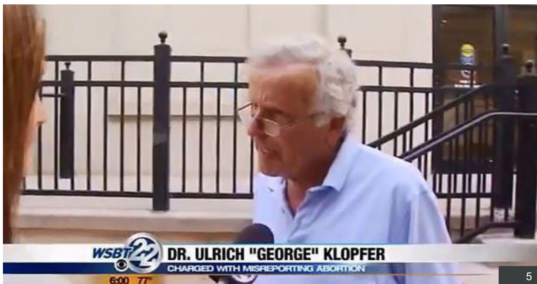
Dr Ulrich Klopfer died on September 3, at the age of 75