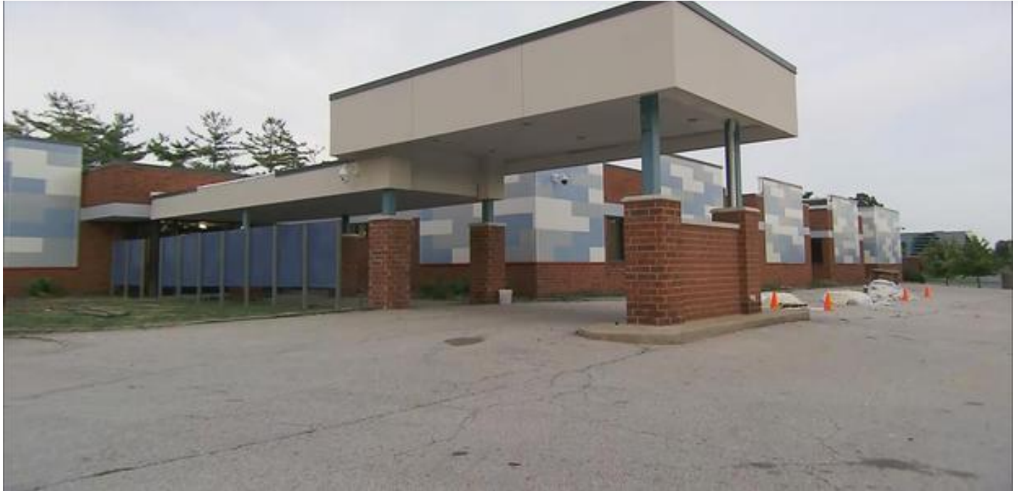
The facility was built in secret to avoid delays to what will be one of the largest abortion clinics in the country.