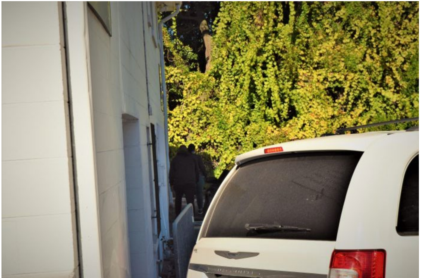
Abortion clinic security guard is seen exiting the clinic with the alleged attacker of a pro-life woman