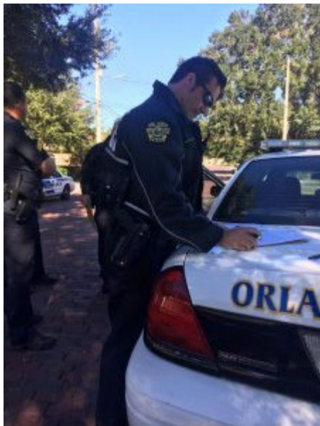
Police take pro-life statements after assault