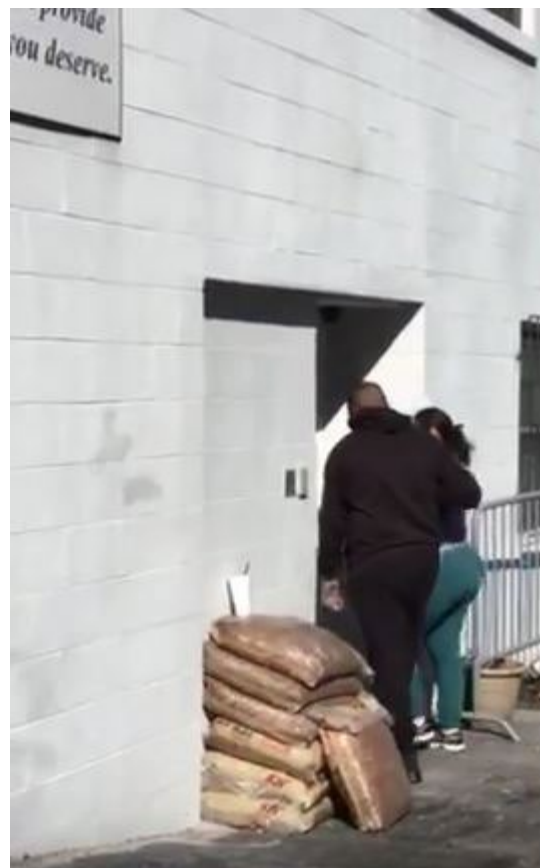
Abortion clinic security guard escorts alleged

Approximately 30 minutes later, Amber said she saw the alleged assailant leave the facility under protective cover of the security guard. “I’ve got pictures of Kerry escorting her in and I have