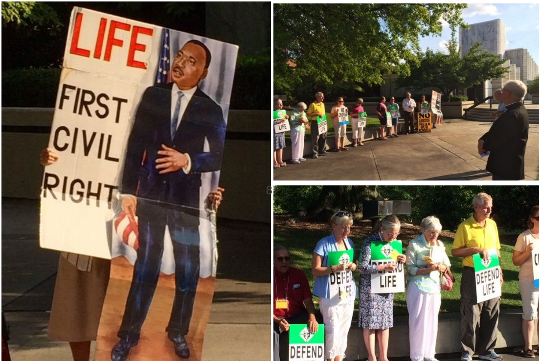
Gallery: Anti-abortion prayer vigil outside Huntsville City Hall