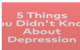
5 Things You Didn't Know About Depression