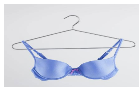
Treating Hidradenitis Suppurativa of the Breasts