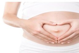
RA & Pregnancy: Pros and Cons