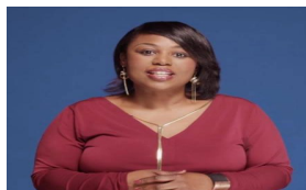
Women's Health: Overactive Bladder Video Center