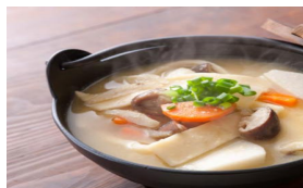
Should You Be Taking Probiotics?