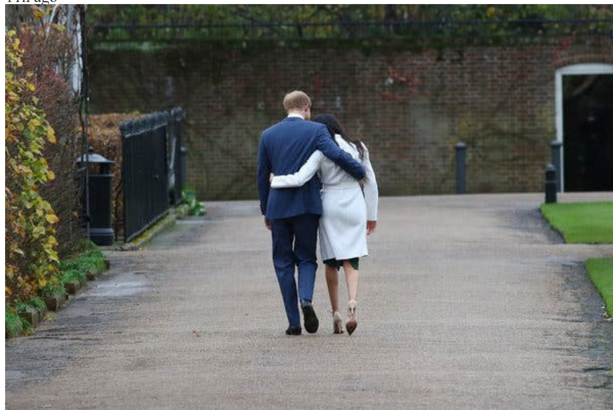
In Statement, Queen 'Supportive' of Prince Harry and Meghan's 'New Life' Jan. 13