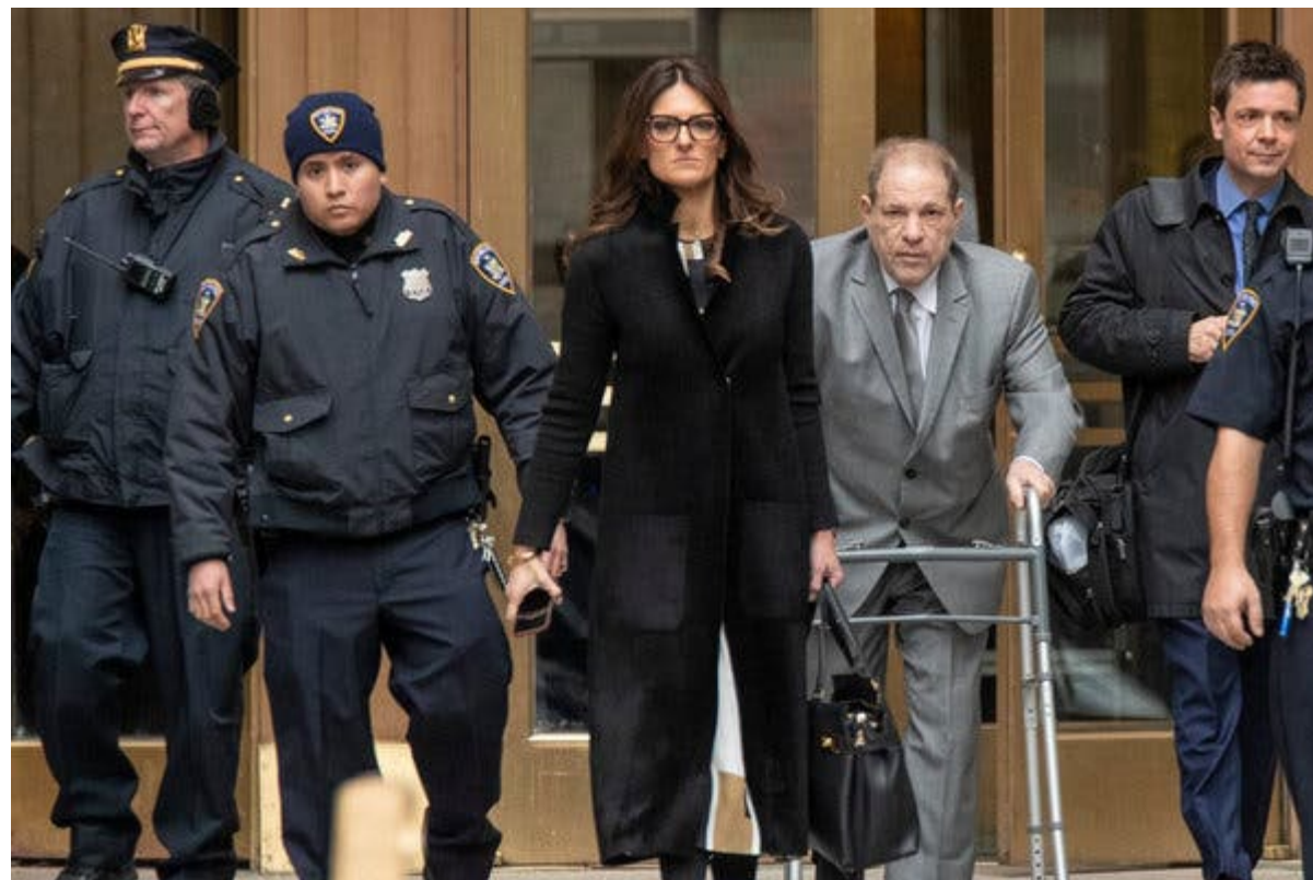
She's Harvey Weinstein's Lawyer, and She Thinks #MeToo Is 'Dangerous' 11h ago