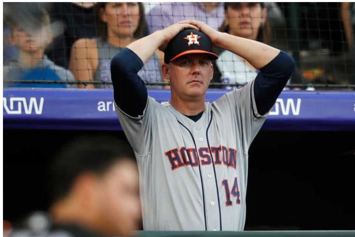
Astros Fire Two, but That Won't Clean Out Baseball's Den of Thieves 4h ago