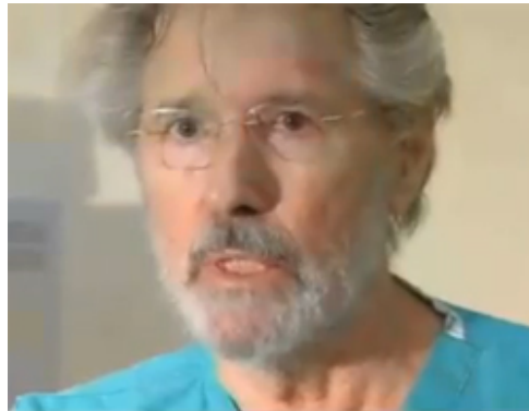
Late-term abortionist Curtis Boyd

Dr. Curtis Boyd is no stranger to controversy. In 1973, Boyd opened the Fairmount Center, which was the first abortion clinic in Texas. Boyd is the only doctor in North Texas who will perform late-term abortions to women up to six months pregnant.