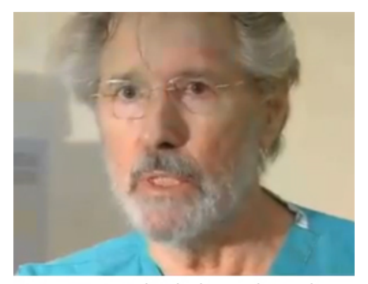
Late-term abortionist Curtis Boyd

Dr. Curtis Boyd is no stranger to controversy. In 1973, Boyd opened the Fairmount Center, which was the first abortion clinic in Texas. Boyd is the only doctor in North Texas who will perform late-term abortions to women up to six months pregnant.