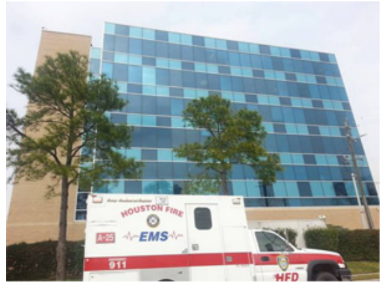
February 6, 2015: An ambulance arrived at the Planned Parenthood abortion facility in Houston, Texas, to transport an abortion patient to the Emergency Room, according to the Houston Coalition for Life.

( https://www.operationrescue.org/archives/court-records-indicate-nearly-1000-abortion-patients-likely-hospitalized-annually-in-texas/ ) indicate that as many as 1,000 women are hospitalized in Texas each year due to abortion complications.