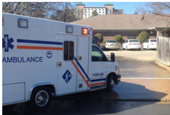
An ambulance arrives at Little Rock Family Planning Services on February 7, 2015, to transport yet another abortion patient to the hospital.

Activists with Every20Seconds.org posted video of the incident on Facebook