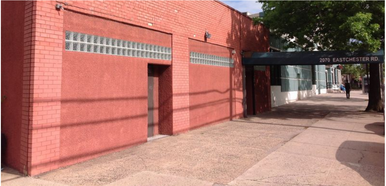
Bronx Abortion is located in a nondescript brick building on Eastchester Rd. in the Morris Park section of the Bronx. (Denis Slattery)

Anti-abortion activists don't "like" the way this Morris Park clinic promotes its services.