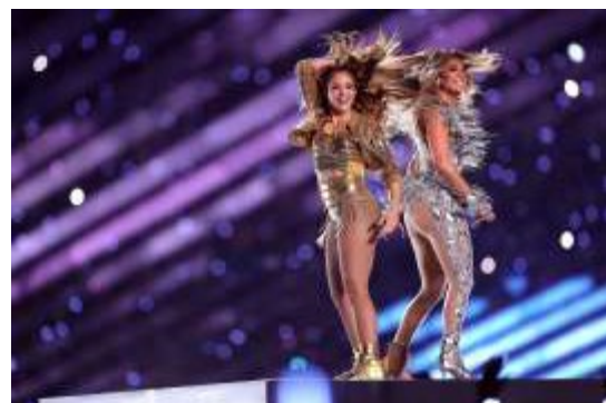
Super Bowl LIV halftime show

Woman scammed loved ones for $5M, prosecutors say