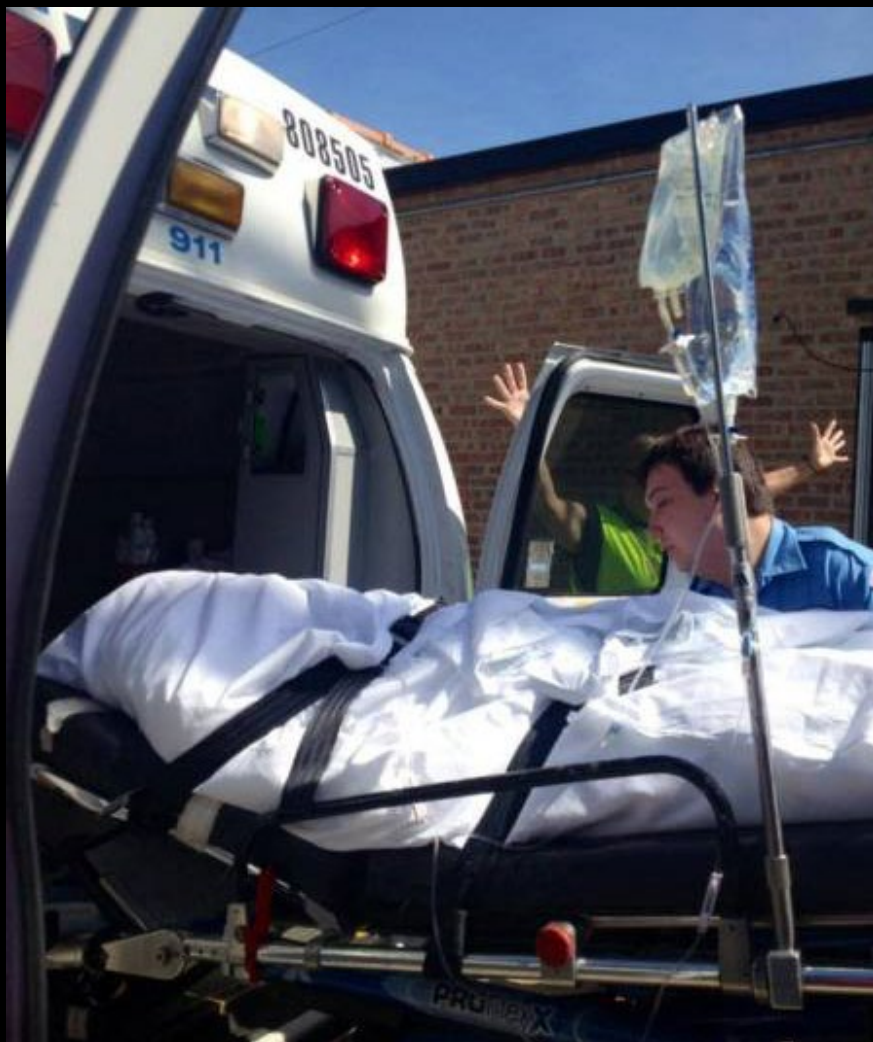
Family Planning Associates Medical Group calls themselves, "one of the most trusted abortion care providers in the nation."