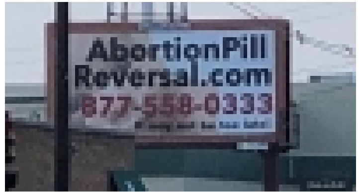
Two Abortion Pill Reversal billboards near Planned Parenthood removed after threat from billboard stand owner (/two-abortion-pill-reversal-billboards-near-planned-parenthood-removed-after-threat-from-billboard-stand-owner)