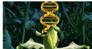
Hyper Assembly Cloning Kit - Fast and directional cloning

† May not add up to dollar total at top of page, since a payment record may not be associated with any product or can be associated with several products.