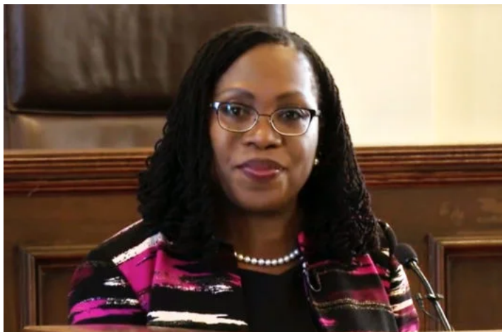
Joe Biden Says He'll Nominate a Black Woman to the Supreme Court. Here Are